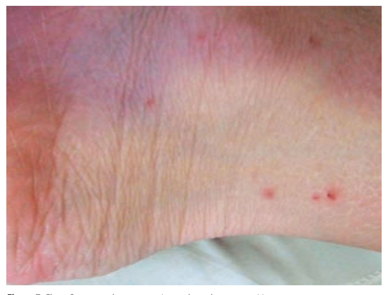
Figure 7. Churg-Strauss syndrome: purpuric papules on lower extremities.

of the onset of the disease. Generally, the outcome of patients with slight hematuria and proteinuria is good, while in less than 5 percent of the cases terminal renal disease occurs after a 10 to 25 years follow-up. Patients with nephritic or nephrotic syndrome have poorer prognosis.<sup>23-25</sup> We found a similar ratio of patients with renal alterations in our work (24 percent); however, none of our patients had long-term morbidity, which may be due to a shorter follow-up term so far.