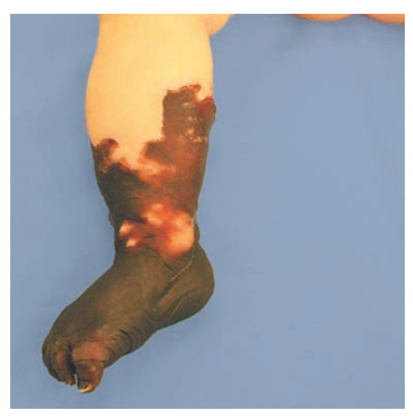
Figure 4. Kawasaki disease: right lower extremity necrosis secondary to vasculitis.

Fifty five percent of our patients had an infection at the time of diagnosis. The most frequently found etiologic agent was \beta-hemolytic Streptococcus, as referred in multiple reports.<sup>20</sup> It is worth mentioning that we found references of 47 HSP cases in clinical records, but only 33 fulfilled EULAR/PReS diagnostic criteria;