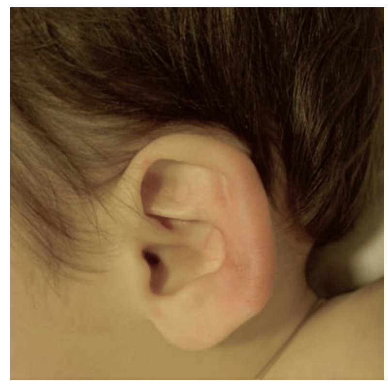
Figure 6. Acute hemorrhagic edema of infancy: erythemato-purpuric lesion of left pinna.