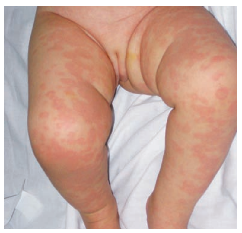
Figure 3. Kawasaki disease: maculopapulous exanthema.

with wrist arthralgia, and ankle arthritis (Figure 7). No livedo reticularis or ulcerations were observed. Also no myalgia, systemic arterial hypertension, neuropathy or testicular tenderness appeared. Dosage of antineutrophil antibodies was negative. No pharingitis appeared and streptest and throat culture were negative; however, a high 1250 IU/ml ASTO titration was detected. Hepatitis B serology was negative. Skin biopsy confirmed the presence of vasculitis in small dermo-hypodermal vessel and small arteries. The indicated treatment consisted of rest, nonsteroidal antiinflammatory drugs, meprednisone 60 mg/day and prophylactic penicillin. The patient had favorable outcome, without recurrences so far.