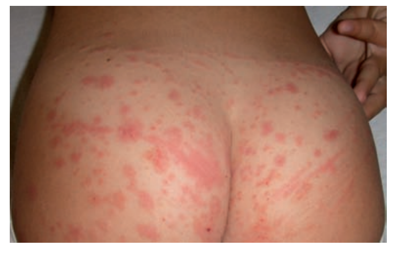
Figures 1 y 2. Henoch-Schönlein purpura: palpable purpura in lower extremities with distribution pattern on the buttocks and legs.

Streptococcus pyogenes in throat swab culture; and 3 patients had pneumonia, two of them with positive IgM for Mycoplasma pneumoniae. In addition, three patients referred history of recent immunization. In one patient, Escherichia coli was isolated from an urinary infec-