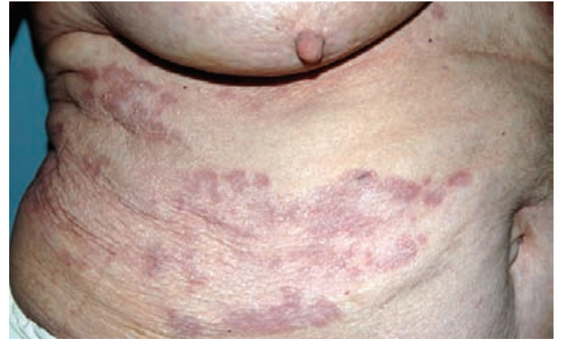
Figure 3. Case 2: Erythematous to violaceous plaques. Annular disposition.

Three months later, the patient was examined for abdominal pain. An abdominal ultrasonogram and a CAT were performed, with a 15 ′ 11 ′ 9.5 cm gastric tumor visualized and totally excised. Histopathological diagnosis was gastrointestinal stromal malignant tumor.