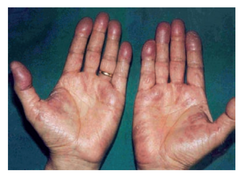
Figure 1. Case 1: Painful acral granuloma annulare.