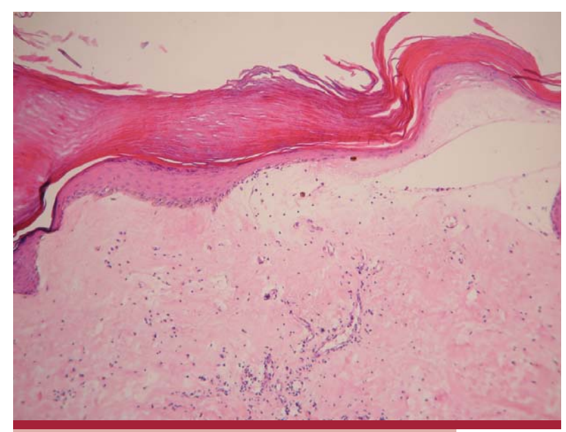
Photo 2: Atrophic epithelium, dermal edema and inflammatory infiltrate.

Histology evidences a thinned epithelium with flattening of the dermo-epidermal junction and varying degrees of keratinization. There may be spongiosis and vacuolar degeneration of the basal layer. The dermis looks edematous with hyalinization of collagen fibers, intense mixed inflammatory infiltrate and dilated blood and lymphatic vessels with red blood cell extravasation (Photo 2)<sup>3</sup>.