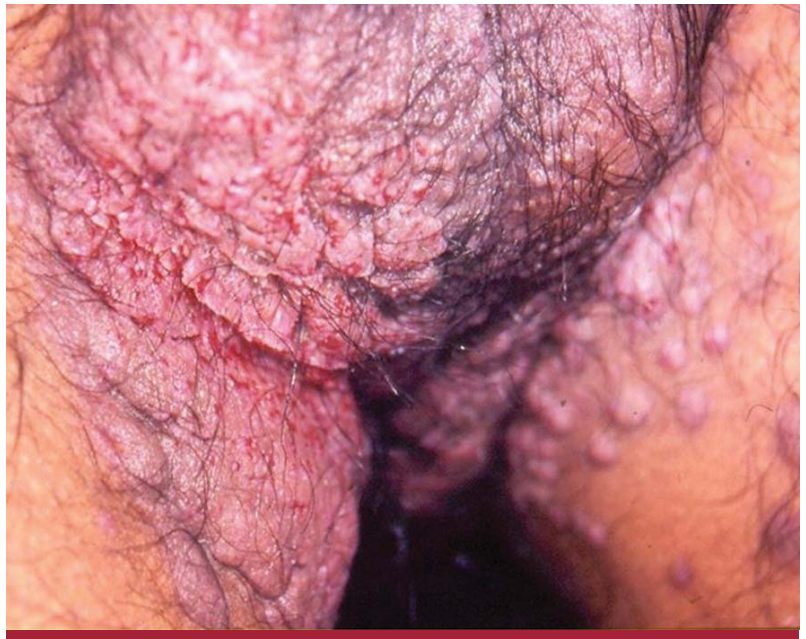
Photo 5: Inguinoscrotal and intergluteal fold. Vegetating lesions with erosive, oozing surface.

There are drug-induced cases, among which we can mention the angiotensin converting enzyme (captopril 12 , enalapril 14 ) and penicillamine 10 . It has even been suggested that a patient might have developed pemphigus vegetans as a consequence of intranasal heroin abuse 10 . The chemical structures of both captopril and penicillamine are made up of highly reactive sulfhydryl groups which could bind to pemphigus antigens and generate acantholysis. Heroin could act as another ligand of these antigens 10 . In the case of enalapril, its relationship with pemphigus induction is not very clear-cut 14 .