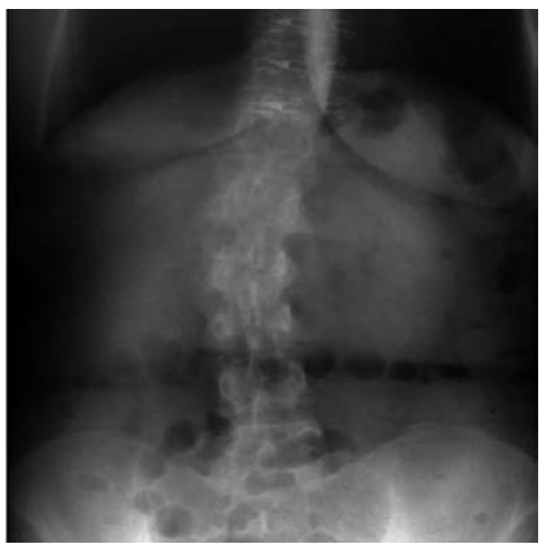
Figure 3. Spine X-ray evidencing marked scoliosis.