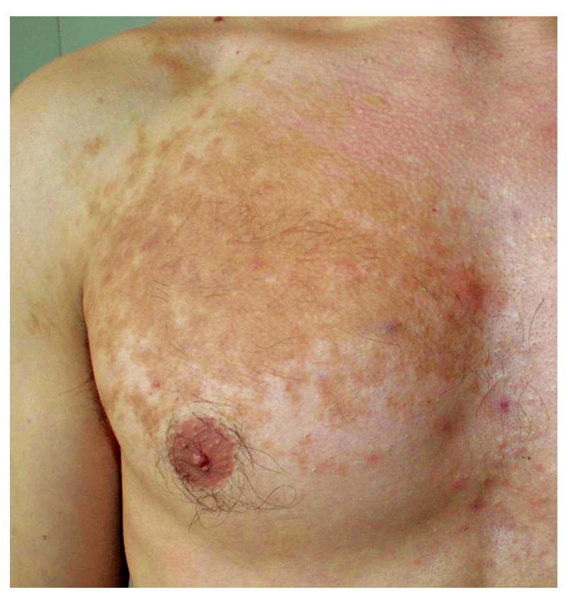
Figure 1. Becker's nevus and chest asymmetry with right side dominance.

Becker's nevus is a hamartomatous lesion that many authors consider an organoid nevus, and thus probably reflects cutaneous mosaicism;2 characterized by the presence of two or more populations of genetically different cells derived from the same zygote.3 It is described as an isolated, acquired lesion, hyperpigmented lesion in a color ranging from light tan to dark brown, measuring several centimeters in diameter, with sharply demarcated but irregular margins, and small peripheral affected skin "archipelagos" surrounding the lesion. Most lesions are described as hypertrichotic, and the most typical location is on the deltoid area. Different series refer a male dominance, with a male/female ratio from 2:1 to 6:1.45 It is androgen-dependant and thus considered a "functional" nevus. This explains a more frequent